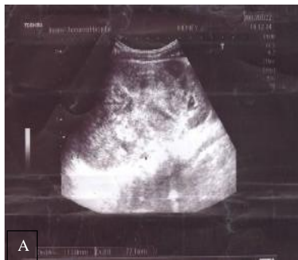
Fig. 1. Abdominal ultrasound views (a, b) demonstrate a 14× 19 cm mass at the lower pole of the left kidney.

Abdominal ultrasound demonstrated a 14× 19 cm mass at the lower pole of the left kidney and numerous para-aortic lymphadenopathies (Fig. 1).