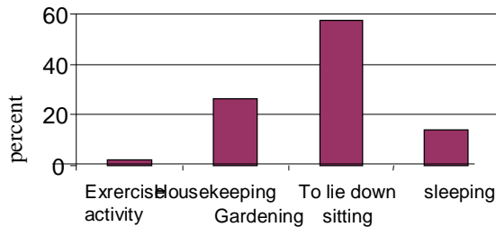
Fig. 1. Frequency of physical activity of subjects at leisuretime

CHD in the men was more than that in the women (43% vs. 28%). Conversely, the prevalence of hypertension in the women was more than that in the men (27% vs. 17%). Also, 48% of the patients were illiterate, and 52.3% of the patients had a low income (less than $125 per month). The frequency of seeking medical advice amongst the urban people was more than that amongst the villagers (53% vs. 46%). Daily physical activity data revealed that 48% of the individuals did not have morning exercise, 55% of the subjects were walking and cycling for commuting, and the others used private or public transportation. Amongst the subjects that did not have walking or cycling exercise, 31% had CHD, 19% had hypertension, 23% had other cardiac diseases, and only 24% were healthy. At leisure time, 24% had exercise and physical activity and others spent their time sitting, lying, watching TV, sleeping, etc. (Fig.1).