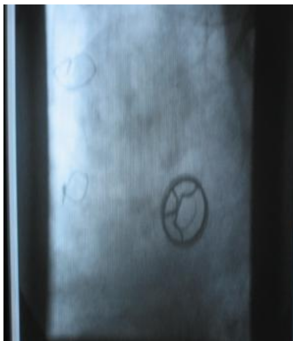
Fig. 2. Fluoroscopic evaluation of the patient shows abnormal movement of prosthetic valve leaflet (malfunction).

In our case atherosclerosis of the intima and interruption of elastic fibers was found, but these findings were misinterpreted as luetic arteritis.