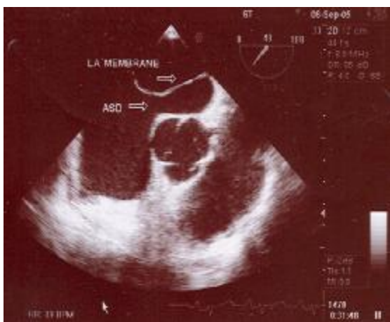
Fig. 3. Transesophageal image showing left atrial membrane attachment to septum primum and Warfarin ridge