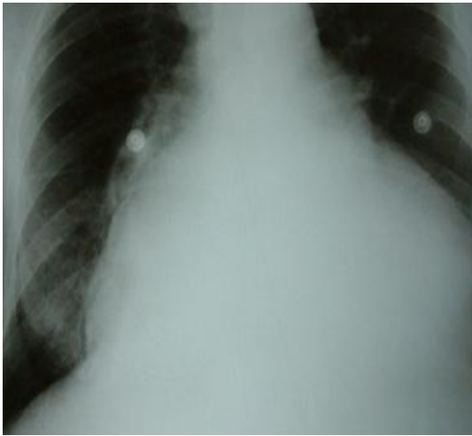
Fig. 2. CXR shows significant cardiomegaly.

Chest X-ray showed significant cardiomegaly (Fig. 2). Transthoracic echocardiography was performed for evaluation of underlying causes and showed prominent myocardial trabeculations in the left ventricle (LV), with deep inter-trabecular recesses (Fig. 3) that communicated with the LV cavity; blood flow into the recesses was demonstrated by color Doppler examination, which is pathognomonic for IVNC.